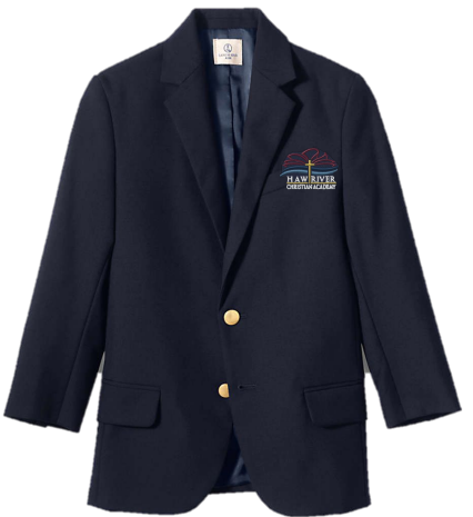
Oxfords, Ties and Blazers for chapel days