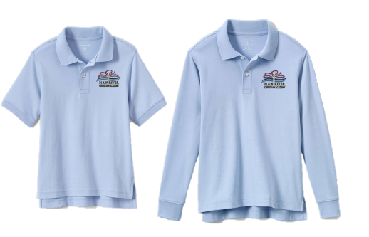
Polos for non-chapel days